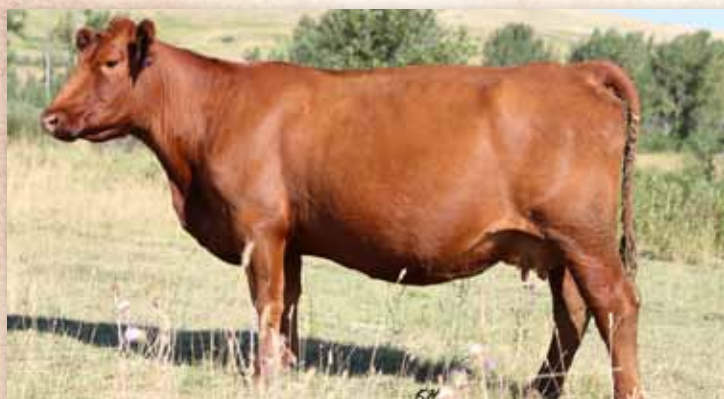
Dam of Lot 40: DKK Auburn 454

If you are looking for a calving ease female maker -- check out this bull. He is a direct Make Mimi son that goes back to Nexus and Grand Canyon. He is extremely quiet natured, long spined and dark red. His dam is a long, deep sided, pretty uddered, excellent dispositioned female.