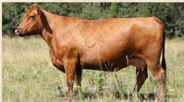
Dam of Lot 15: DKK Olivia 325