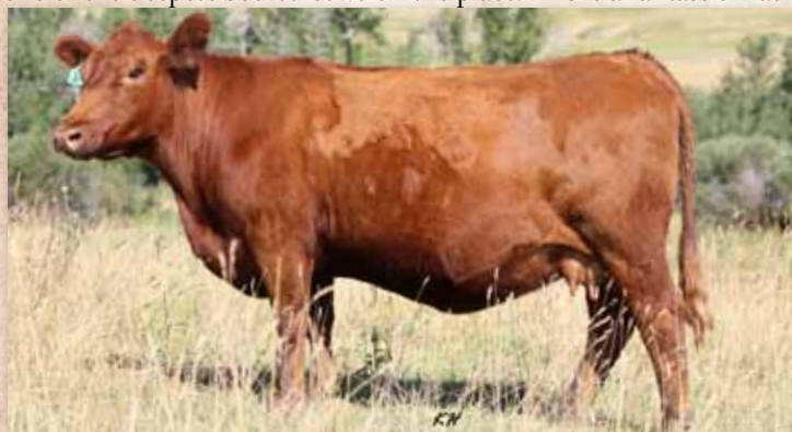
Dam of Lot 9: CK Melody 576

Here is a good footed, soft made, well put together, direct Make Mimi son. If you are looking for some Rock Solid older genetics with calving ease -- Check this bull out. His Mama is a fantastic cow and she brings home a beauty every fall -- beautiful udder, perfect feet, and one of the deepest bodied cows on the place. This is a fantastic mating that will make some lovely females.