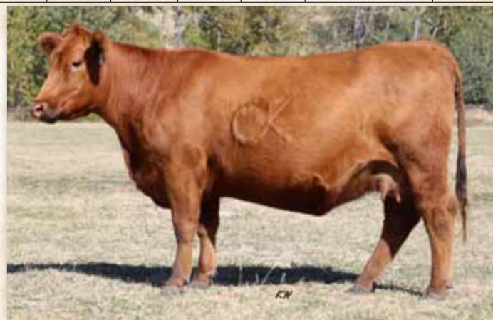
Dam of Lot 21: DKK Impress 5102

PIEOneOfAKind352 PIE One of a Kind 510 GEF Cutting Queen Silveiras Mission Nex DKK Impress 5102 DKK Impress 9048 Buf Crk Right Kind PIE Fayette 1160 Haycow CuttingEdge GEF True Queen LJC MissionStatemnt Silveiras DAORV 4L Super Vision DKK Impress N38