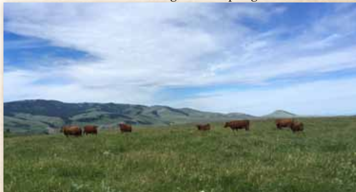
Grazing on meadow pasture