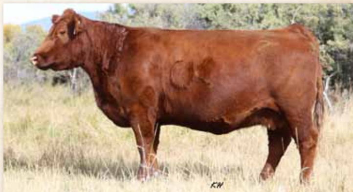
Granddam of Lot 18: DKK Matteline 191