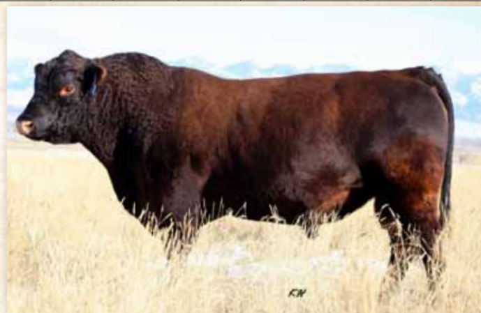
Sire of Lot 33: PIE One of a Kind 510

PIE One of a Kind 510 GEF Cutting Queen Bieber Make Mimi DKK Angie Rose 6092 GMRA Angie Rose BufCrkTheRightKind PIE Fayette 1160 Haycow CuttingEdge GEF True Queen 55x BJR Make My Day Bieber Sirena 6708 Messmer Packer S008 GMRA Angie Rose