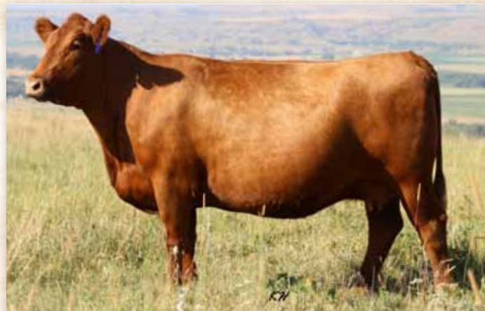
Dam of Lot 4: DKK Diamond 2125

BufCrk TheRightKind 5L Independence 560-298Y 5L Black Adina 560 CT Red Rock 0721 DKK Diamond 2125 2RR GR 502 Buf Crk Lancer R017 Buf Crk Shoshone TC Stockman 365 5L Adina 293-525 4L Super Vision CT Miss Pan 409 Ballensky GoldRobbr LMB Chiefette 144