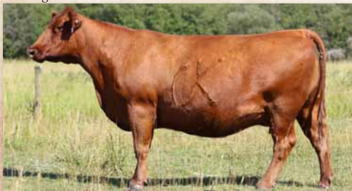
Dam of Lot 20: DKK Dixie 086

Just like good whiskey – Smooth, Bold & Quiet. Many compliments to his fabulous dam (pictured below). Excellent feet, udder, capacity, disposition and mothering ability. Now, let me introduce you to the sire, Loosli Manhattan: He has amazing feet, an excellent disposition, his daughters are fabulous momma cows and he is bar none one of the best bulls we have ever purchased.