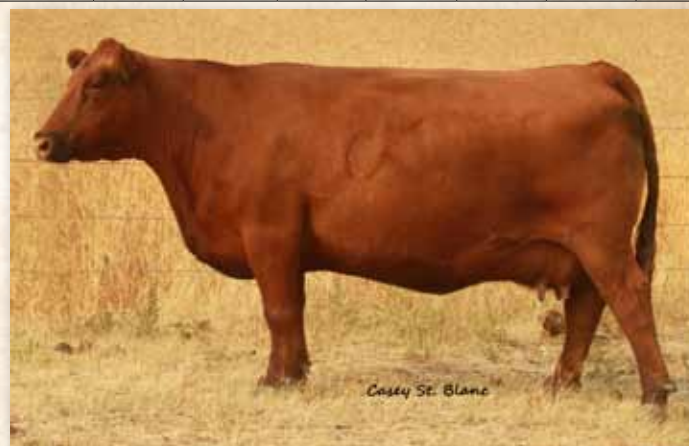
Granddam of Lot 52: DKK Auburn P35

Beckton Nebula P707 Beckton Lana M809 Brown JYJ Redemption Y1334 JYJ Ms Jolene W16 LJC MissionStatemnt HXC Jolene R548 Andras NewDirection Andras In Focus Andras Kuruba B111 DKK Auburn 6149 LCHMNGrandCnyn DKK Auburn 607