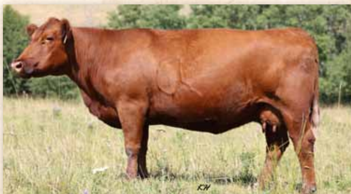
Dam of Lot 41: DKK Lakme 3111