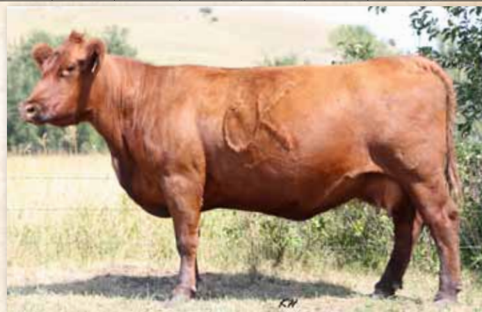
Dam of Lot 36: DKK Eleanor 275

DKK Captain 434 DKK Captain Incredible 6042 DKK Starlette 07 DKK Grand Vision DKK Eleanor 275 DKK Eleanor 8053 CT DKK Duke 1100 DKK Ramblin Ruby LJC MissionStatement DKK Starlette K28 4L Super Vision DKK Impress 744 CT Wildfire 0515 DKK Eleanor R06