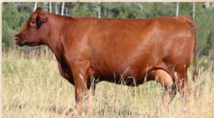
Dam of Lot 10: DKK Auburn 350