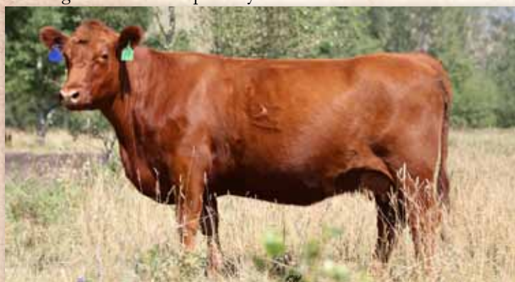
Dam of Lot 27: CRSF Paprika 57

Here's some fresh genetics to consider. This bull has a big time birth to weaning growth spread. He started out at 63 pounds at an 83 ratio, then had an actual weaning weight of 775 ratio 103. This long and attractive bull comes with great carcass traits, notice 142 ratio for marbling. He has the deep cherry red color we're all after. His dam has a perfect udder and great feet.