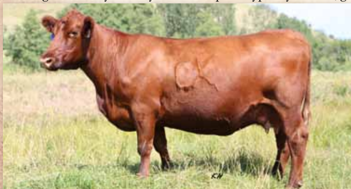
Dam of Lot 51: DKK Harmony 274

If you sell your calves by the pound, 8191 should spike your interest: top 12% of the breed for CW, top 10% for WW, top 30% for YW and top 20% for REA. Additionally, this guy has a great disposition, he's extra long, clean and smooth.....and did you see his dam? She's amazing – definitely a family favorite. A phenotypically flawless, good natured, broody mama cow.