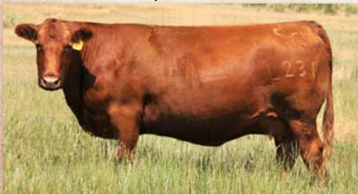
Dam of Lot 17: Buf Crk Marigold L231

Loaded with goodness, this calving ease bull (top 1% of the breed for both CED and CEM) also claims the top 20% of the breed for heifer pregnancy. A deep, thick made stout boy that has a dark red coat. His EPDs may not show it yet; but this guy scanned a 5.84 IMF (144 ratio); and a 13.01 inch rib eye.