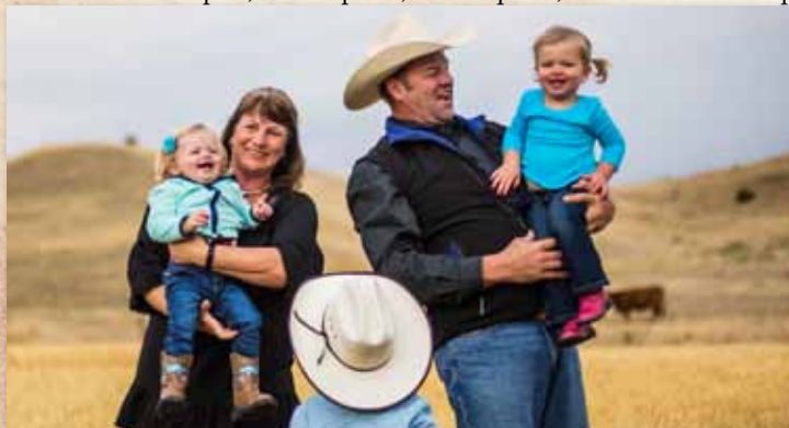
The best part of our business ... is our Family!

Moderate framed & loaded with style. This guy's pedigree reads like the who's who in the Red Angus breed; representing 5 generations of nothing but A.I. matings and cow families of Lakota, Belga, Lana, Angie Rose, Waco and Dixie. Additionally, sporting the following EPDS: ADG top %, YW top 7%, GM top 9%, WW and REA top 11%, CW top 22%. Unsurprisingly, he scanned a 4.7 IMF (103 ratio).