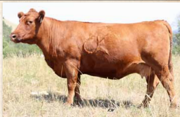
Dam of Lot 56: DKK Lakota 347

DKK Captain 434 DKK Captain Incredible 6042 DKK Starlette 07 Messmer Packer S008 DKK Lakota 347 DKK Lakota 608 CT DKK Duke 1100 GMRA Angie Rose LJC MissionStatement DKK Starlett K28 Messmer Joshua 019P Messmer Millie 124P DKK Addiction N10 DKK Lakota P25