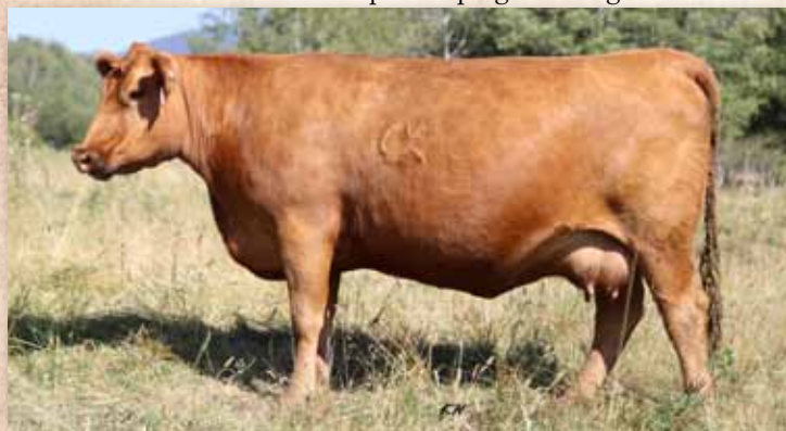
Dam of Lot 12: C-T Rainbow 3084

A Calving Ease STUD with a Huge Hip and Large Testicles. Extra deep and thick made, stands wide and he's running with the "big boys" – check out his ADG of 3.65 and 13.22" ribeye. Many compliments go to his beautiful, powerful, yet balanced dam (103.6 MPPA) and his One of a Kind 510 sire that keeps stamping out the good ones