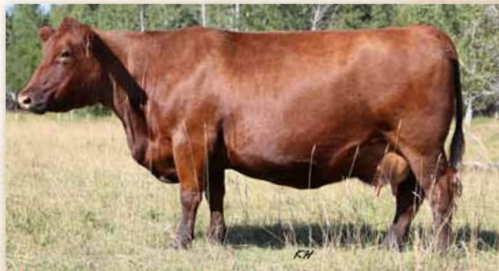
Dam of Lot 60: DKK Sheba 149