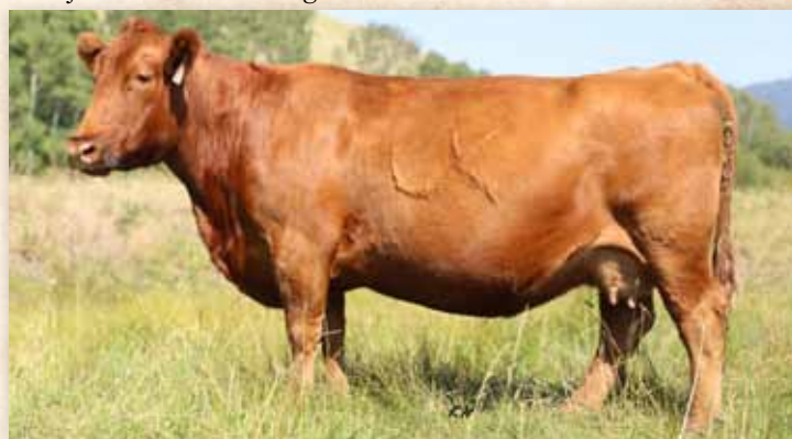
Dam of Lot 43: DKK Matteline 029