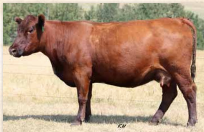
Lot 4 Dam: Feddes Lakina B21

DKK Captain 434 DKK Captain Incredible 6042 DKK Starlette 07 Feddes Conquest Y34 Feddes Lakina B21 Feddes Lakina X158 CT DKK Duke 1100 DKK Ramblin Ruby LJC MissionStatement DKK Starlette K28 HXC Conquest4405P Feddes Blockana 429 Feddes Elway 8114 Feddes Lakina 91S