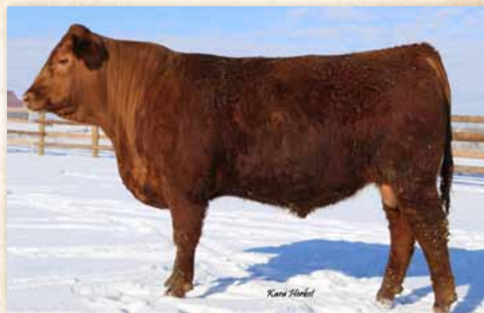
Sire of Lot 3: DKK Captain 434

CT DKK Duke 1100 Fritz Justice 8013 DKK Captain 434 GMRA Angie Rose DKK Ramblin Ruby FineLineMulberry DKK Ramblin Ruby DKK Ramblin Ruby CT Grand Statement LJC MissionStatement DKK Matteline 344 CT Miss Pan 0760 DKK Matteline M52 BJR Make My Day DKK Miss Rambo