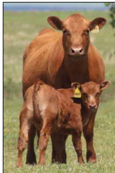
Independent research studying five years of Superior Livestock Auction data confirms the value of Red Angus replacement females.

Over the years, stockmen have voted with their checkbooks, purchasing heifers they know will bring profitability to their ranching businesses – and Red Angus females are their most-favored choice. ■