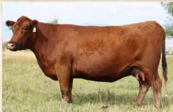
Dam of Lot 37: DKK Wind Song 8016

DKK Captain 434 DKK Captain Incredible 6042 DKK Starlette 07 DKK Priority R07 DKK Wind Song 8016 DKK Wind Song 615 CT DKK Duke 1100 DKK Ramblin Ruby LJC MissionStatement DKK Starlette K28 LCC Major League DKK Sassina M23 FCC Rambo 502 CK's Miss Pan 2051