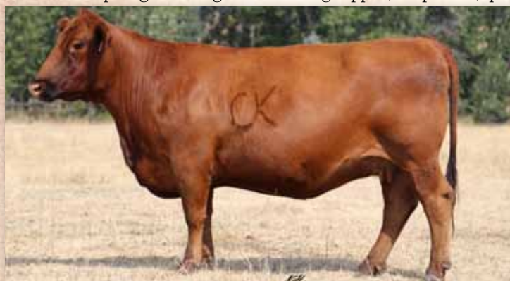
Dam of Lot 14: DKK Dazzle 155

Even though he's the youngest bull out there he really fits in with the bunch. The bull is a natural calf out of one of our donor cows. His mother is one our favorites with loads of capacity. He weaned at a 108 ratio, and scanned a ribeye ratio of 112. Check out his ribeye EPD in the 1%. Expect great things from this big topped, deep sided, quiet natured bull.