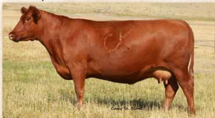
Dam of Lot 58: DKK Harmony 8073