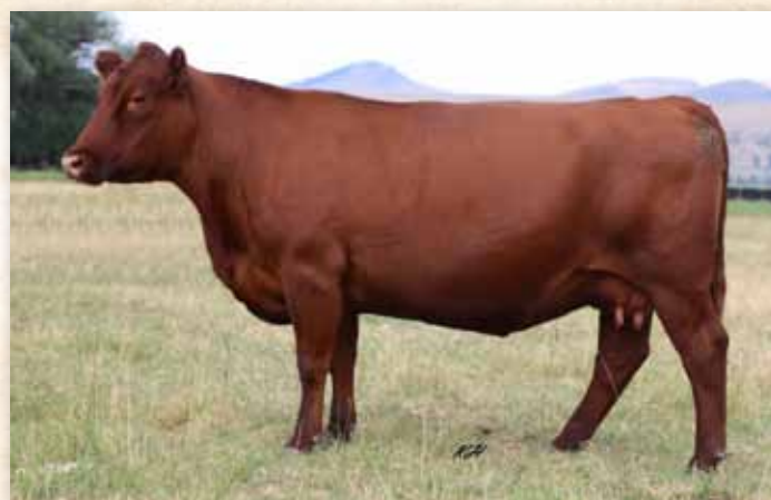
Dam of Lot 32: DKK Starlette 320

CT DKK Duke 1100 Fritz Justice 8013 DKK Captain 434 GMRA Angie Rose DKK Ramblin Ruby Fine Line Mulberry HXC Conquest 4405 Beckton Julian B571 DKK Starlette 320 HXC Ellie May DKK Starlette 145 CT Big Chief 0934 DKK Starlette 9047