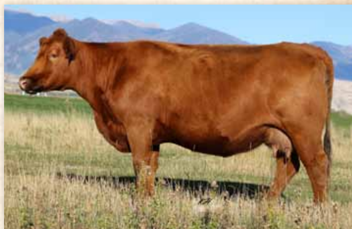
Dam of Lot 16: DKK Impress 9048

DKK Captain 434 DKK Captain Incredible 6042 DKK Starlette 07 4LSuperVision R2292 DKK Impress 9048 DKK Impress N38 CT DKK Duke 1100 DKK Ramblin Ruby LJC MissionStatement DKK Starlette K28 Glacier Chateau 744 4L MR Rambo R709 BJR JR 107 DKK Impress 744