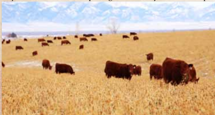
Red Heifers and Beautiful Mountains

Who said that calving-ease sires don't have enough performance? Check out the numbers on this dude: Top 19% of the breed for GM, top 9% HB, 24% CED, 32% BW, 24% WW, 14% YW, 8% ADG and 6% CEM. A clean-made, quiet natured bull that is challenging the Big Boys with a 3.5 ADG and posting a 12.41" ribeye. I am not surprised when I look at the maternal strength of this pedigree.