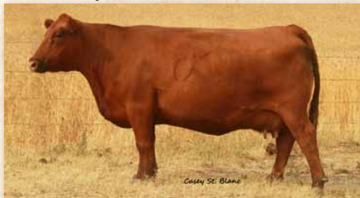
Granddam of Lot 35: DKK Auburn P35