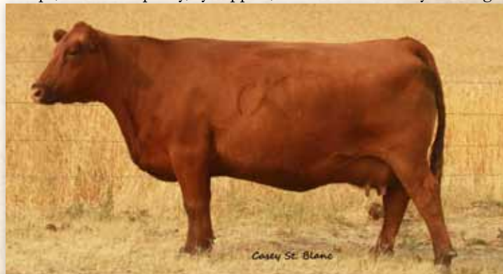
Dam of Lot 6: DKK Auburn P35