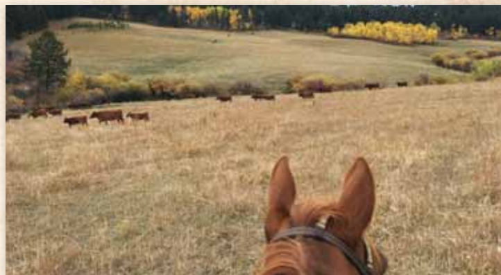
Pulling pairs out of the mountains in the fall.