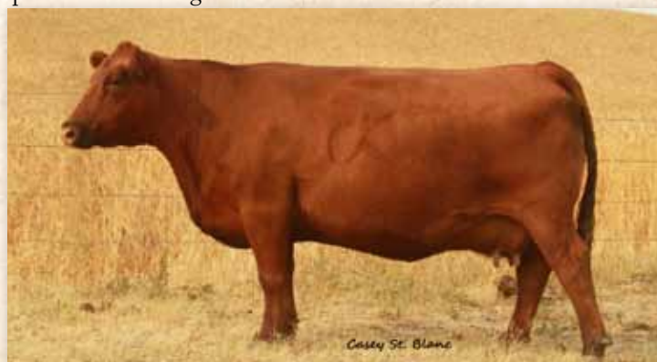
Dam of Lot 28: DKK Auburn P35