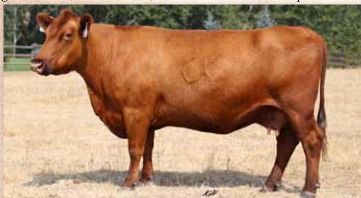
Dam of Lot 57: DKK Olivia 8001

He sports a 115 WR and a 105 YR; a 4.96 IMF index (122 ratio) and 13.5 inch ribeye (104 ratio). A little different pedigree; but very grounded with his beautiful 11 year old Chateau Mamma. They don't stay around in our herd that long unless they are really good – and good she be (MPPA 105.14). Loosli Manhattan has impeccable feet, an excellent disposition.