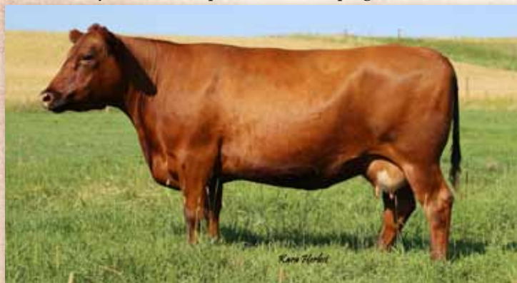
Dam of Lot 34: DKK Starlette 9047

Top 2% of the breed for HB and top 10% GM.....and fancy, fancy, fancy. Deep cherry red, quiet natured, moderate framed and excelling in structure. A calving-ease bull that you won't want to pass up. I absolutely love his Starlette 9047 donor dam who claims a 104.4 MPPA . As with every cow that we put into a donor program; she has an excellent udder, feet and presence.