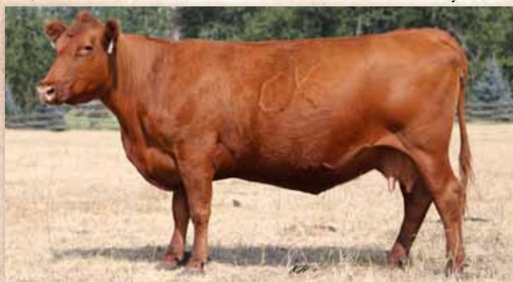
Dam of Lot 42: DKK Impress 8046

That extra length of spine always packs on the pounds – no wonder this guy claims a 3.82 ADG. Moderate framed and LOADED with maternal; 8138 claims the Impress cow family, but also has strong ties to the Ramblin Rubys, Starlettes and Angie Roses (on the paternal side). Dam's MPPA 103.4 – she's not still in our herd at 11 years old without just reason – she's a good one!!!